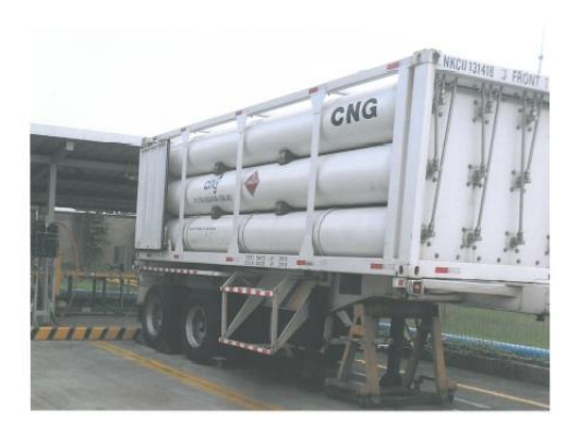
For illustrative purposes only. "