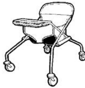
X - Frame