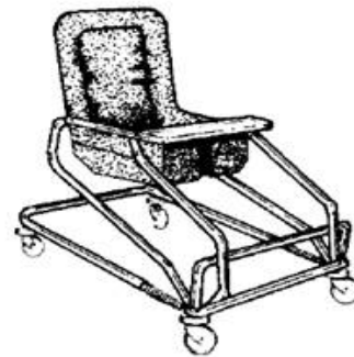
Bouncer - Walker