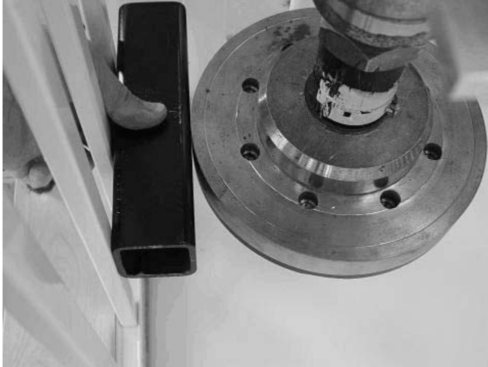
Figure D. Impact Mass and Spacer Block.