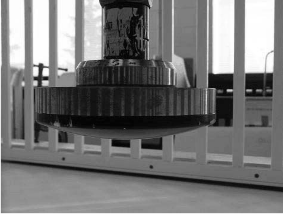
Figure B. Impact Mass

(E) 8.6.2.3 A 6 in. (150 mm) long gauge.